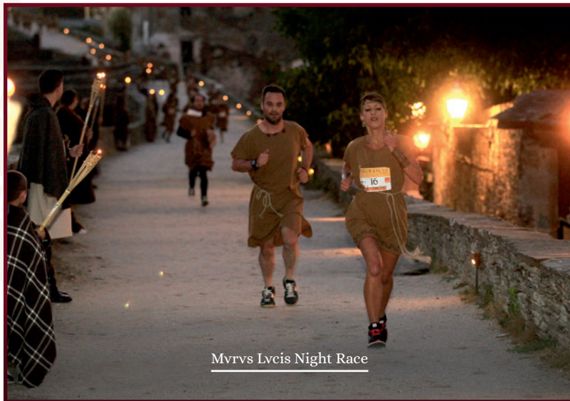
Mrvs Lvcis Night Race

Lost fantasy 20:45 h • Pr. Campo Castelo and the city streets