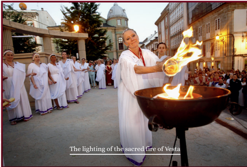
The lighting of the sacred fire of Vesta

👤 Activity with a sign language interpreter