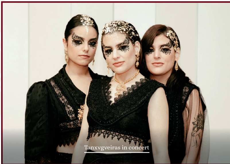
Tanxvgveiras in concert