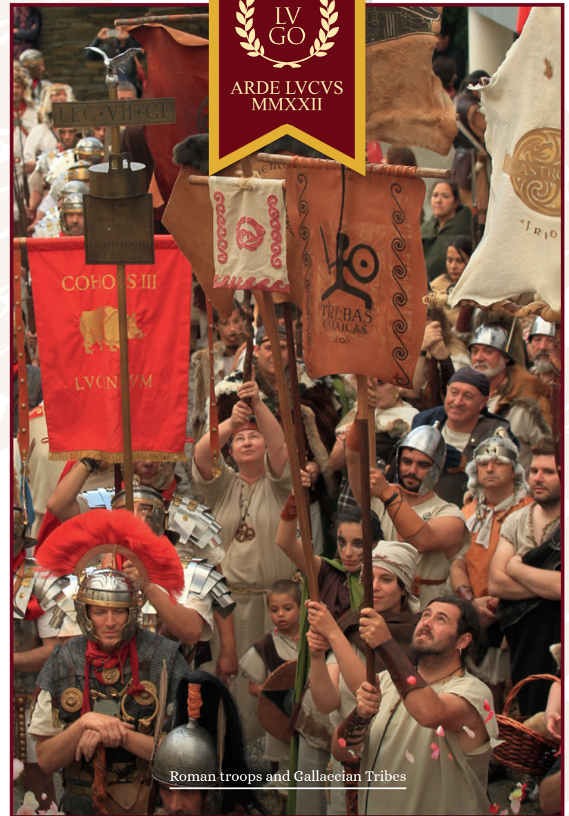
Roman troops and Gallaecian Tribes

13:45 h • Pr. Horta do Seminario and the city streets